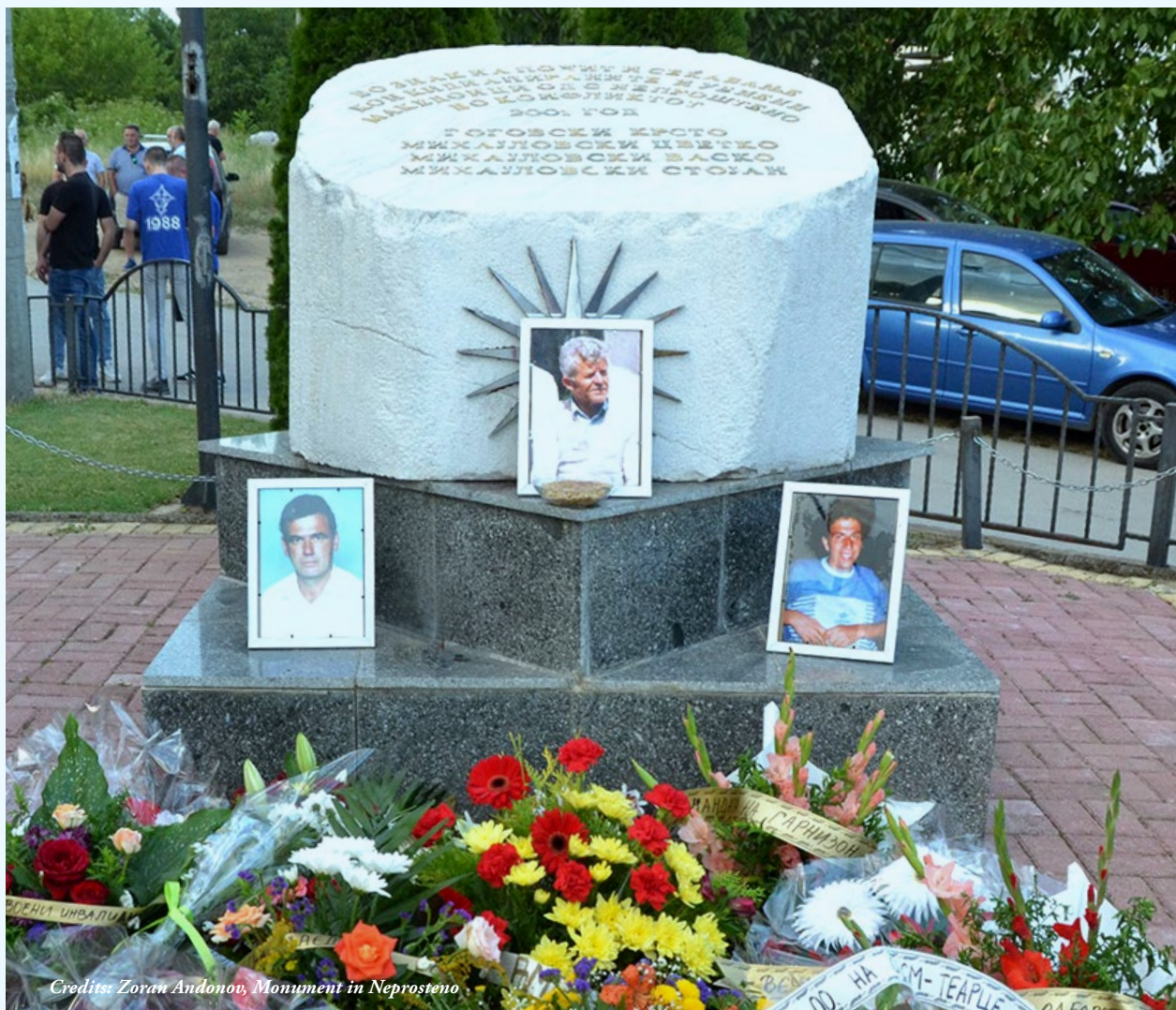
Monument in Neproshteno

The families of the missing Macedonians tried to seek justice through the courts. This was a long and difficult process. The first legal blow for the families came in 2002, when the Parliament passed an Amnesty Law, which pardons ethnic Albanian paramilitary fighters (NLA) who fought Macedonian security forces in 2001. The second and most severe blow came in July 2011, exactly 10 years after the abductions and murders. The Macedonian Parliament adopted an authentic interpretation of Article 1 of the Amnesty Law, voting to dismiss four war-crimes cases returned from the Hague and thereby providing amnesty to